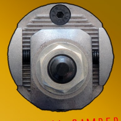
NEUTRAL CAMBER MAX CASTER