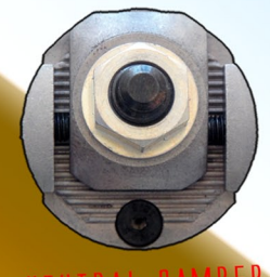
NEUTRAL CAMBER MIN CASTER

ANY SETTINGS INDEPENDENT OF EACH OTHER ARE POSSIBLE!