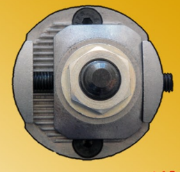
MAX NEGATIVE CAMBER NEUTRAL CASTER