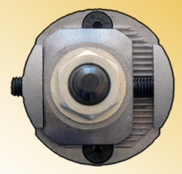
MAX POSITIVE CAMBER NEUTRAL CASTER

NO MORE COMPROMISE, INDEPENDENT CAMBER AND CASTER INFINITE CAMBER ADJUSTMENT, 1 DEGREE CASTER INCREMENTS